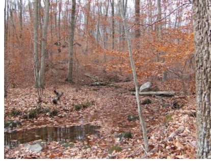
Beech tree illustration by Jennifer Ramirez, 2019