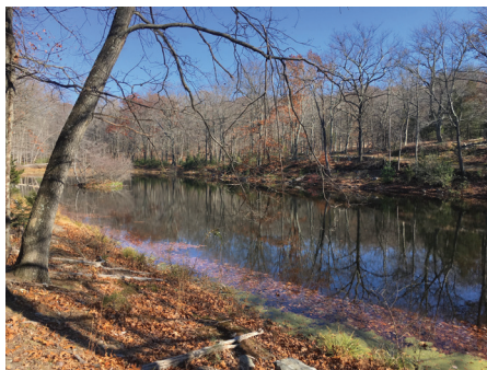
Stone wall illustration by Jennifer Ramirez, 2019