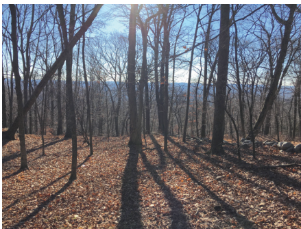
Owl illustration by Jennifer Ramirez, 2019